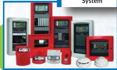
Fire Alarm System 05