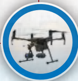
Professional Drone Solutions