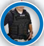
Military Bulletproof Vest