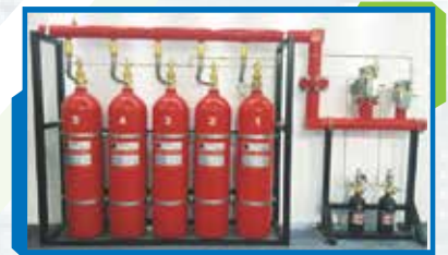
Fm-200 Suppression System

Control Panel (Addressable/Conventional) Smoke Detector Heat Detector Fire Rated cable Fixed Temperature / Rate of Rise Heat Detector Manual call Point Fire Alarm Bell/Horn/Beacon Indication Light/Flashers Monitoring/Control Module Isolation Module Emergency Telephone set Input & output Module Beacon Detector