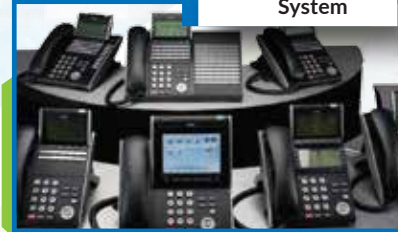
PABX Intercom System 11