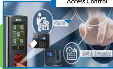
Time Attendance Access Control 02