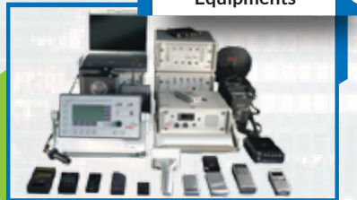
Intelligence Equipments 12