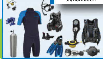
Underwater Equipments 17