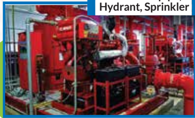
Fire Standpipe, Hydrant, Sprinkler 07