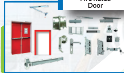
Fire Rated Door 08