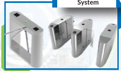
Automatic Access System 03