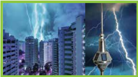
Lightning Protection System (LPS)