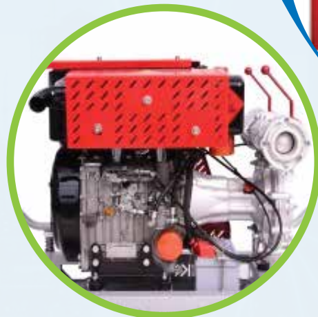
Portable Fire Pump