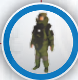
EOD Bomb Disposal Suits