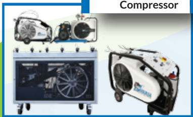
HP Air Compressor 13