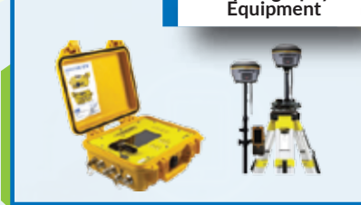
Hydrography Equipment 14