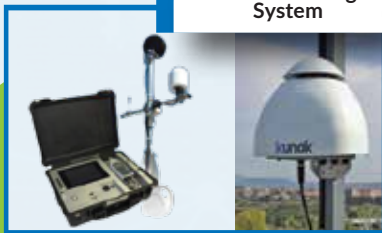
Air Monitoring System 16