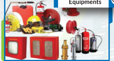
Fire Safety Equipments 06