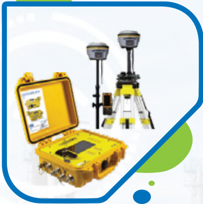
Hydrography Survey Equipments

GPS Tracking System Topographic Survey 3D Laser Scanner