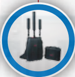
Portable Backpack Jammer