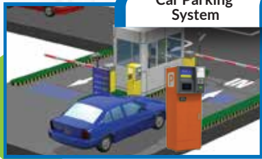
Car Parking System 04