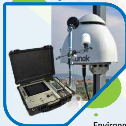
Environmental Monitoring Solution

Gas Analysers & Small Sensor Monitor Gas Calibrators Aerosol Monitoring & Measurment Greenhouse Gas Measurement Meterological Sensors Dust & Particulate Monitoring