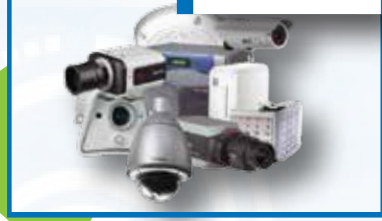
CCTV Solution 01