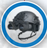
Night Vision Goggles Bulletproof Helmet